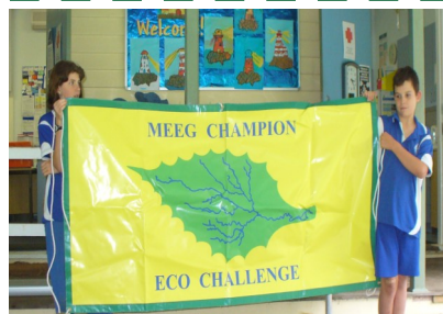
Previous Eco-School Champions Upper Lansdowne Primary School

http://www.environment.nsw.gov.au/grants/envtrust.htm