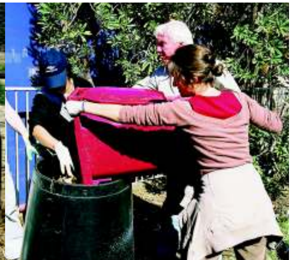
Adding food scraps from a local green grocer to a community garden compost bin.