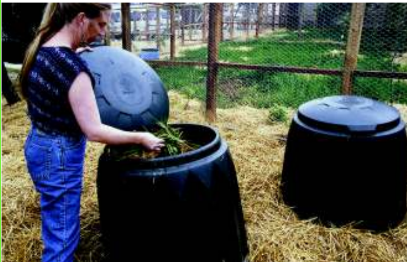
A gardener adds waste materials to make compost in a commercially-available plastic compost bin